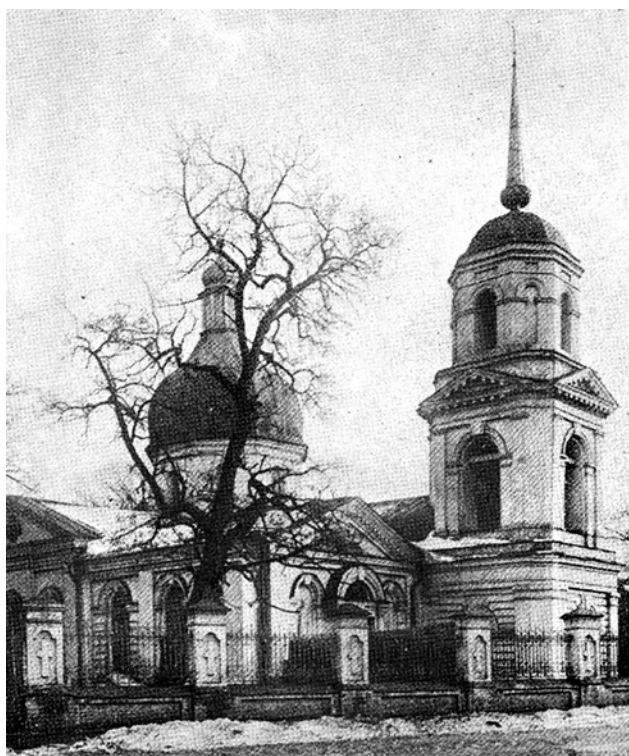
1. The Borysohlub Church, early twentieth century

and to discover the facts that prove the participation of Ivan Yizhakevych in creating the paintings of this church.