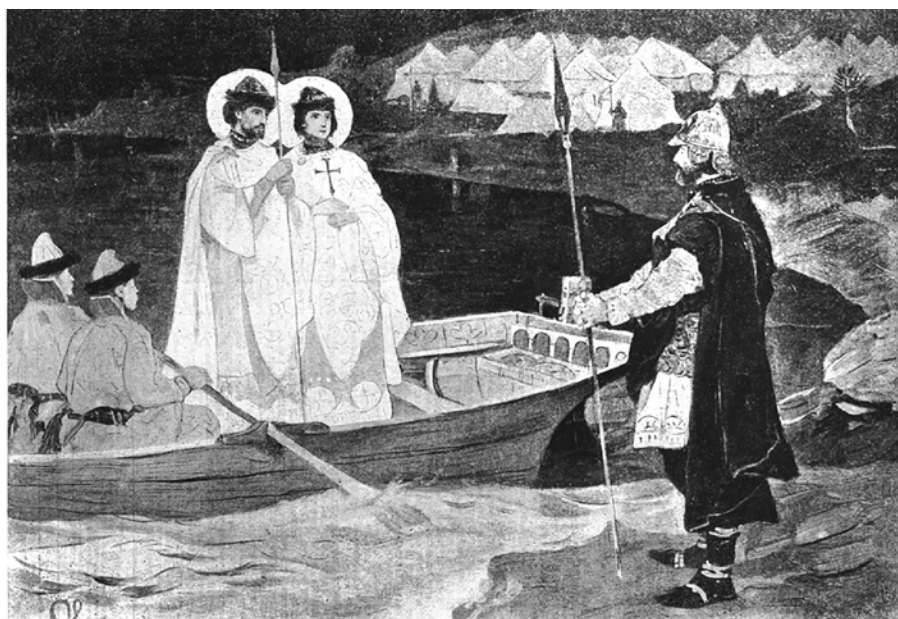
4. “Vision of the warrior Pelgusius. Sts. Borys and Hlib appear to the night guards of Alexander Nevsky,” an illustration from the Niva journal, 1917

Conclusions. Without any reliable evidence and images of the interiors and wall paintings of the Borysohlib church, it is impossible to thoroughly study and analyze the paintings by Ivan Yizhakevych. The study of the entire sacral heritage of the master enabled us to make a number of assumptions about the nature and subjects of his wall painting. In all churches where Yizhakevych worked, he followed similar compositional decisions, which differed only in the regard to the saint, in honor of whom a particular church was dedicated to. Compositions such as “Baptism,” “Holy Communion,” “Nativity,” “Crucifixion,” figures of evangelists, Christ on the throne surrounded by archangels, etc. are found in most of the churches decorated by the master. Therefore, it can thus be suggested that similar images were painted in the Borysohlib church. Unfortunately, it does not seem possible to assert that the study of this temple is yet to come, because all known and available historical evidence about this monument has already been studied by historians. One can only imagine how elegant that wall painting looked and suggest that if the Borysohlib Church had not been destroyed, Ivan Yizhakevych’s paintings would have taken an honorable place in the history of the monumental sacred art of Ukraine.