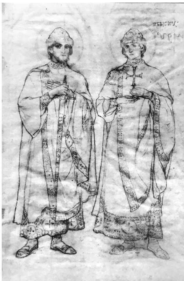
2. Sts. Borys and Hlib, sketch, the 1900s