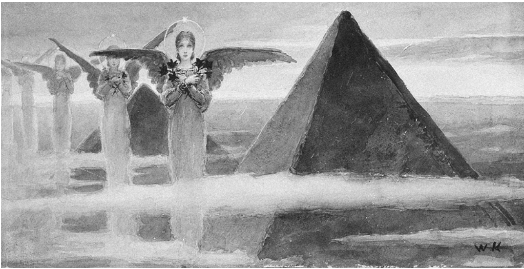
3. Kotarbinski W. Angels of the Pyramids. Date unknown

on the foundation of the Institute of Egypt in that city, with its principal task to study and spread the cultural legacy of the country. Consequently, “<...>a large amount of archaeological data about the rulers <...> was accumulated, and many sepulchers, <...>, temples, obelisks were attributed” [2, p. 275].