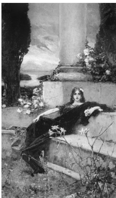
8. Kotarbinskyi W. Evening. The Pensive One . Circa 1900

of the swans depicted to the composition fore. In this case, it can be interpreted from a Christian point of view as a symbol of the dying swan song and meekness. At this, the legs of snake-shaped vases, situated on both sides of the altar, symbolize the tempting evil, which tempts the martyr to deny her faith till the last breath.