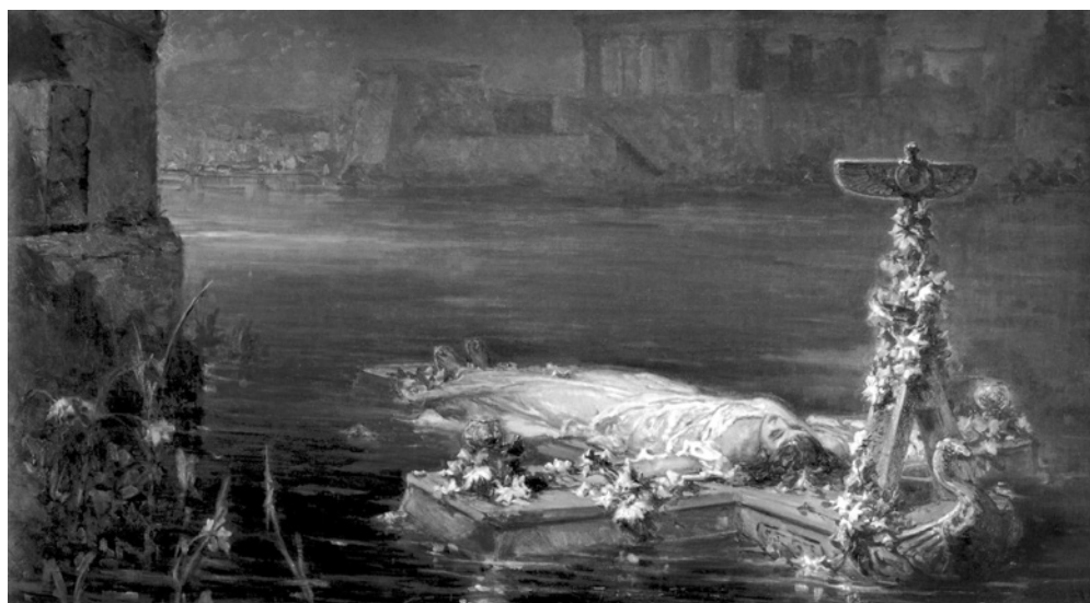
5. Kotarbinski W. The Victim of the Nile. Date unknown

the prism of symbolism and decadence, which enabled combining the historical method with religious mysticism.