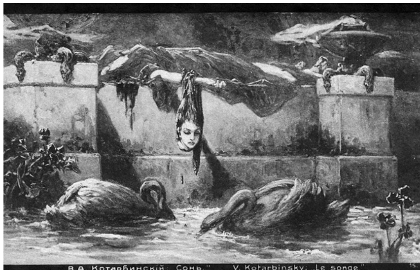
6. Kotarbinski W. Dream. Daughter of Cairo. Date unknown

A creepy and macabre painting “Dream. Daughter of Cairo” (fig. 6) also tells the story of the Egyptian Christian martyr who was decapitated on the votive altar. The outline of her head tied to the hand with hair repeats the silhouette