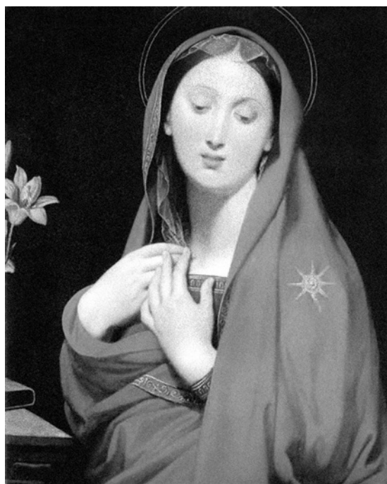
2. Jean-Auguste-Dominique Ingres. Virgin of the Adoption. 1858