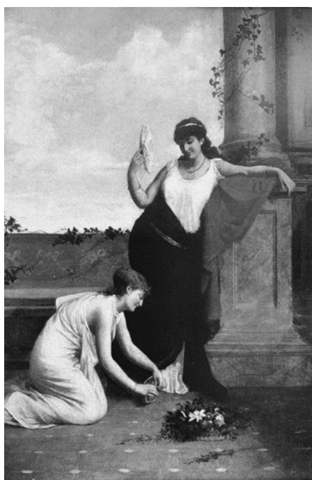
9. Kotarbinskyi W. Antique Girls . Date unknown

Conclusions. Therefore, the Egyptian and the antique subjects in the works of W. Kotarbinski brightly illustrate the impact of the historical method and eclectic trends on the development of new art trends in art in late 19 th through the early 20 th centuries. In the syncretic nature of this artist’s works, one can see the interpretation of the certain qualities inherent to the fin de siècle, in particular, the feeling of fear, the predestination of mankind and spiritual apathy, on the one part, and desperate search of spiritual landmarks attempts to escape the reality into the artificial idealized world of beauty and harmony of drawing-room academism, decadence and symbolism, on the other part.