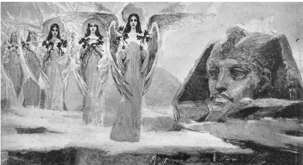
4. Kotarbinski W. Avantgarde. Date unknown

One of the first Ukrainian artists who addressed the Egyptian motives was Wilhelm Kotarbinski. As in the second half of the 19 th century, the oriental motives were mainly used in academic painting, and he was educated in such a school in Rome. However, in the Egyptian studies of W. Kotarbinski, the image component obtained the new tone, being enriched by the innovative stylistic “settings”. Further, in the artist’s works, oriental sciences passed through