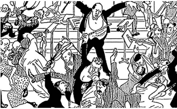
Igor Stravinsky. Rite of Spring. 1913

Synge's Playboy became ever more appreciated for its luxuriously lyrical Irish speech. The Abbey company took advantage of notoriety and toured the play across Ireland, England and into Europe. They added the production to their 1911 American tour when, on opening night in New York (with Gregory seated next to former US President Teddy Roosevelt), scuffles broke out with heckles, boos, hisses, tossed vegetables, and a stink bomb. The tour was interrupted in Philadelphia when the entire cast was arrested for putting on an immoral performance. While the charges were dismissed, the continuing conflict among Irish nationalists of various beliefs continued to disrupt Dublin's theaters into the future.