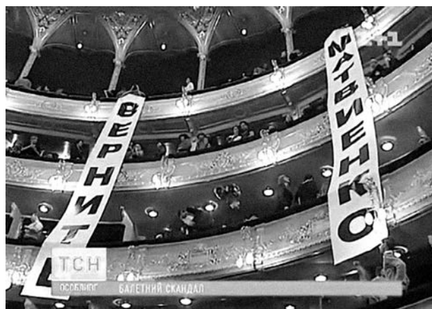
Kyiv Opera House

mistrustful, complaining, from time to time, of a Lahr family vendetta against him. The Coconut Grove Playhouse would find its feet and move on to become a beloved piece of the Miami cultural scene. As it did, it fully embraced its historic role as the home of the American premier of one of the twentieth century's most iconic plays. What was new and shocking had become ordinary and revered.