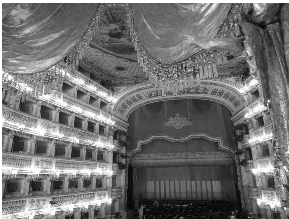
San Carlo Opera House from Royal Box

English playhouses depended less on Royal sanction and support than elsewhere in Europe. A vibrant commercial theatrical culture remained more diverse both on the stage and in the audience. Seating may have been segregated by ticket price. Nonetheless, something of a middling class audience took shape as professional and commercial as well as artisanal and merchant groups — and not a few women — found their way into eighteenth century London's raucous commercial theaters. The city's two Royal Charter theaters — Covent Garden and Drury Lane — remained more democratic than their counterparts on the European continent.