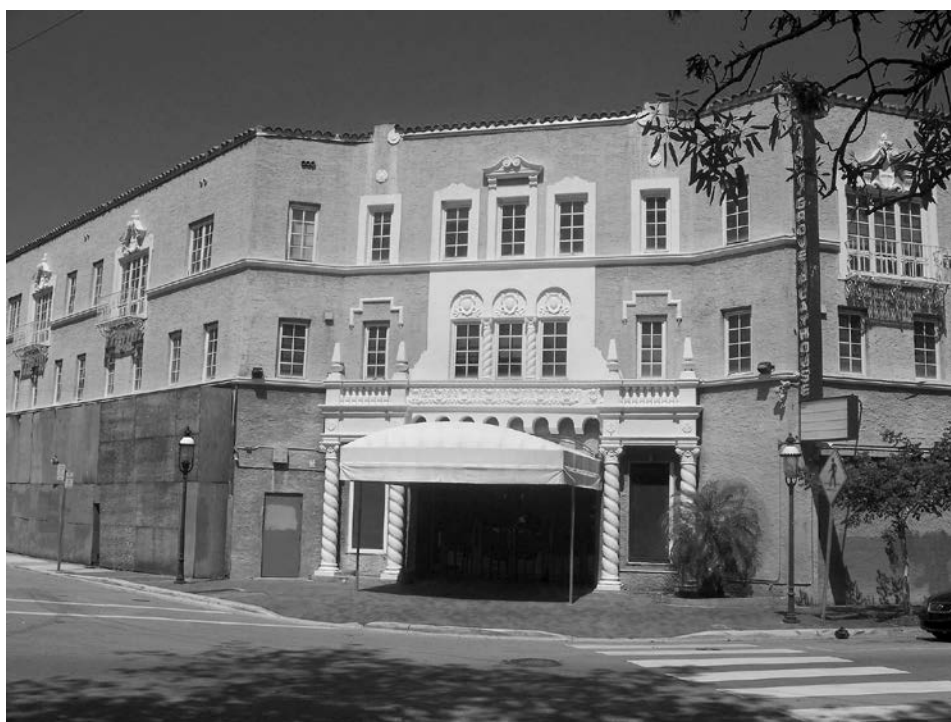
The Coconut Grove Playhouse

The fiasco haunted Schneider for the rest of his career and left its mark on Lahr as well. Lahr, despite claiming to not having understood the role, benefited the most. His subsequent performance as Estragon in New York defined the role for American audiences. Schneider's reaction was more