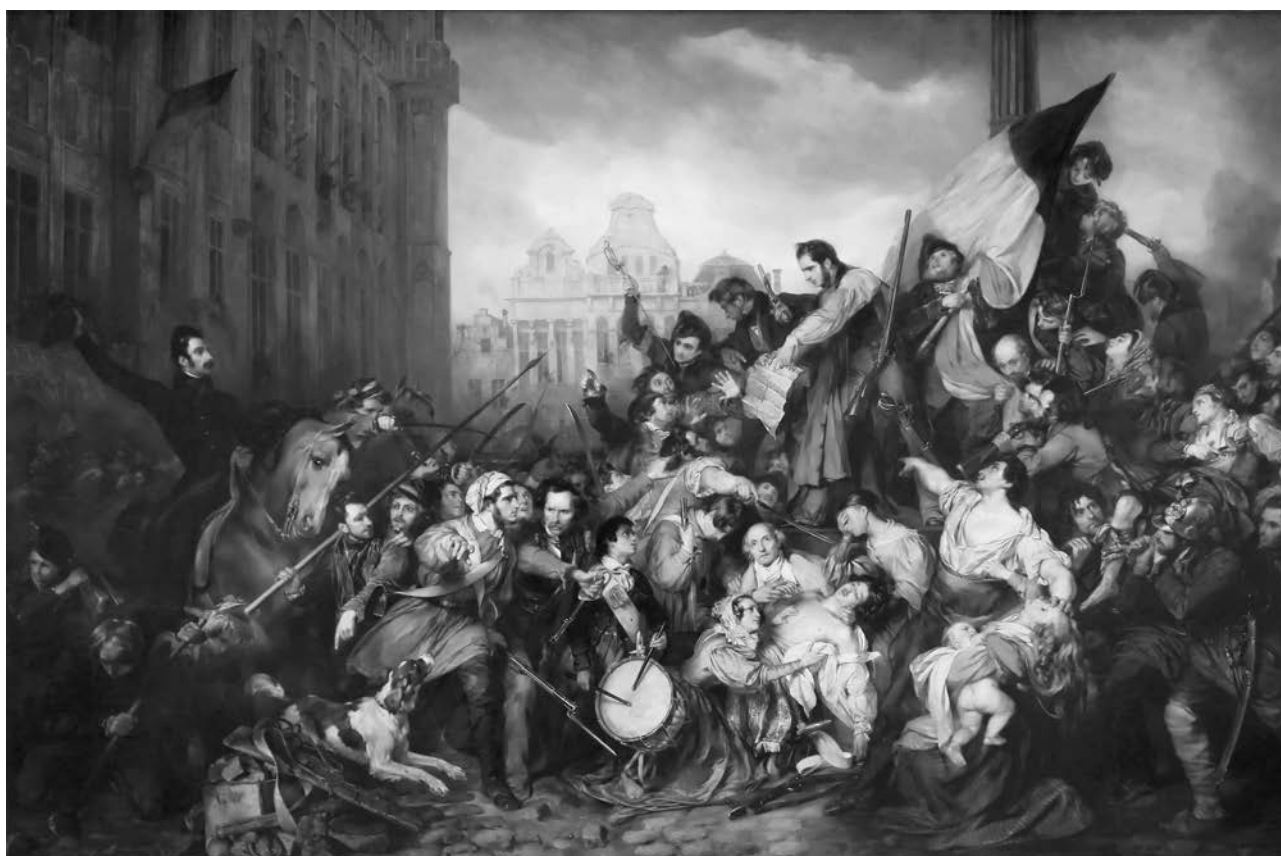
Opera riot. (Gustaaf Wappers «Episode of the Belgian Revolution of 1830», 1834)

The local French language press urged patrons to abandon the opera at the beginning of the fifth act as a sign of protest. The performance never lasted that long. The second act duet "Amour Sacré de la Patrie" ("Sacred Love of Country") brought the audience to its feet with cheers so loud that the performers had to cease and restart. At the line "Aux