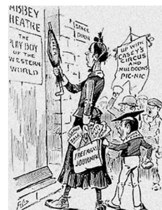
Playboy of the Western World, 1907

On November 4, 1712, local Tory colonial administrators forbade the reading of a proclamation in honor of Queen Anne on the birthday of her predecessor William III of Orange. Ireland had become a social powder keg as “New English” regime clients laid claim to lands previously held by Catholic and old Protestant gentry. Bitter conflicts among Protestants and Catholics, landholders and their tenants, Newbies and Old Timers were set to detonate.