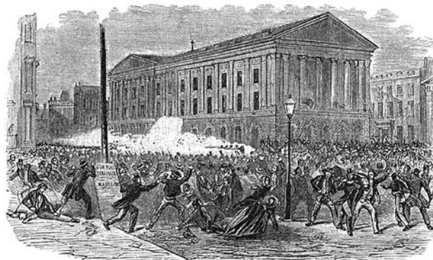
Astor Place Opera House Riot, 1849

For all of New York’s dynamic economic and population growth, the city’s Italian population at the time remained in the handful of hundreds. Da Ponte took it upon himself to promote his native culture. Upon hearing that the highly regarded Spanish tenor Manuel Garcia was bringing an opera company of equally famed family members to New York, Da Ponte sprang into action. Linking Garcia up with top New York impresarios, Da Ponte helped Garcia and local promoters to stage Rossini’s Barber of Seville in November 1825.